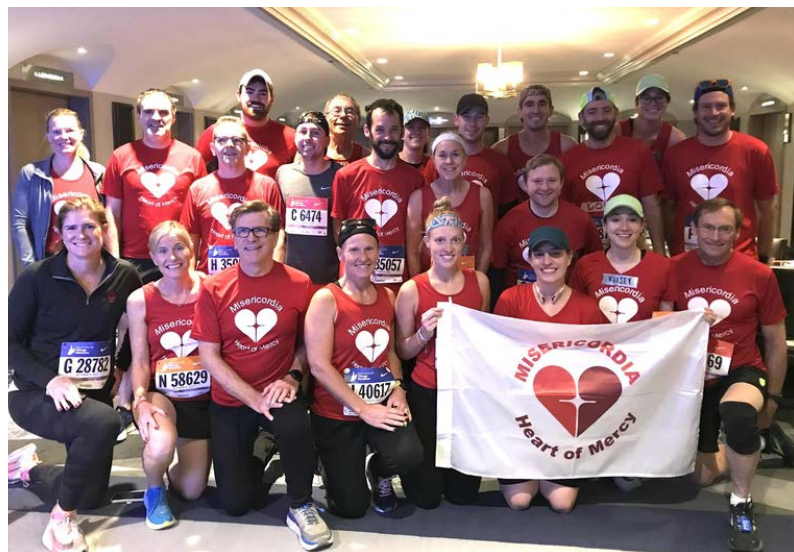
Pictured: Misericordia's 2022 Chicago Marathon Heartracers Team.

Misericordia is proud to be a charity partner for the 2023 Bank of America Chicago Marathon scheduled for Sunday, October 8, 2023. Don't miss your opportunity to be guaranteed a spot in the Chicago Marathon and go the extra mile for Misericordia!