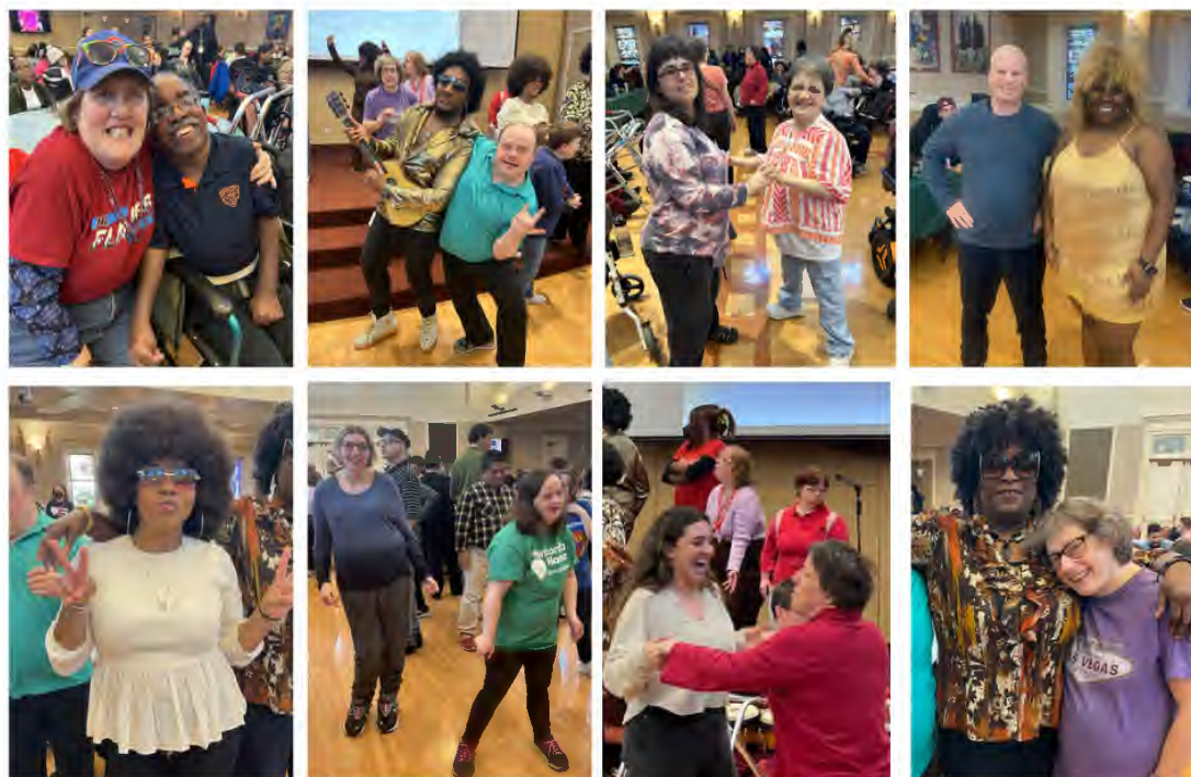
Pictured left: Staff and residents at the Black History Month Exhibition and Soul Train event in the Jean Marie Ryan Center, last Friday, February 23. The event included a visual exhibit of Day Services projects in honor of the month, as well as music and live performances.