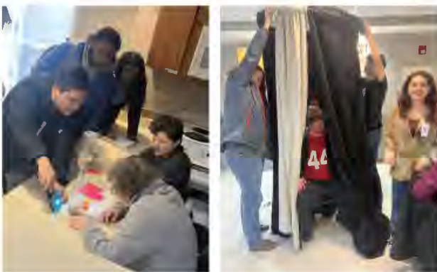
Pictured: Village residents working with engineering students from Northwestern University's DTC program, which develops tangible solutions to any accessibility challenges that affect the independence and activities of daily life for Misericordia's residents.