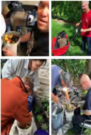
Pictured: Staff and residents in Walsh-Slattery CILA composting food waste.

Over two years ago, a team of dedicated staff asked for permission to use the backyard of the Walsh-Slattery CILA as a test-site for developing a compost program that could potentially involve all of Misericordia “somewhere down the soil rich road”. Although we are not quite there yet, much progress has been made: this team has had preliminary meetings with various management personnel for their input, they added volunteers to the project, and most importantly, some CILA residents have participated in various aspects of the composting process, from gathering to harvesting and beyond.