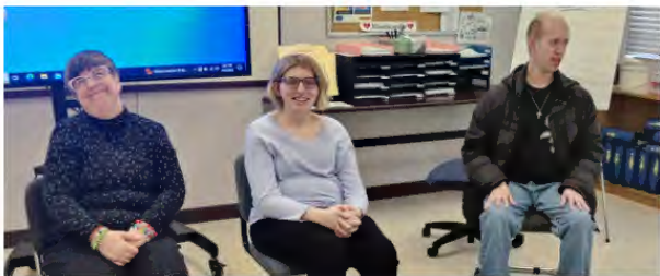
Pictured: Residents from the Village at the Resident Panel for incoming staff

Staff Development is excited to announce the return of the Resident Panel for incoming employees. The Resident Panel consists of residents from various parts of campus, speaking on their human rights, and their experiences at Misericordia. It is also an opportunity for new staff to ask questions and gain perspective into the lives of people living at Misericordia!