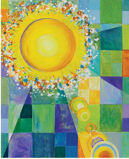
Signature Piece Sunny Summer Days