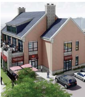
Above: a digital rendering of the Hearts and Flour Bakery and Cafe.

We are excited to announce that Misericordia's Hearts and Flour Bakery and Cafe is projected to open in mid-July! It will be located on Ravenswood Avenue, less than 1/4 mile from our campus! Read more about it on page 18 of our annual report.